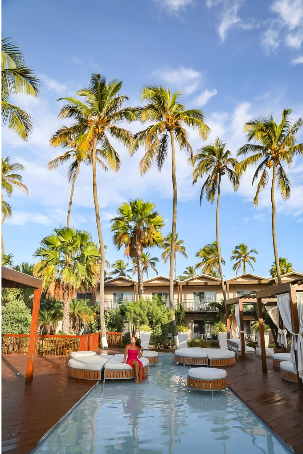
ARUBA - View of one of the pools at DIVI Aruba All Inclusive J.Q. LOUISE