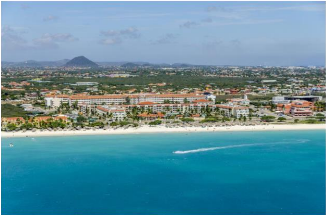
Aerial view of the beach Palm Beach on the island of Aruba. Place where most of the large hotels are ...