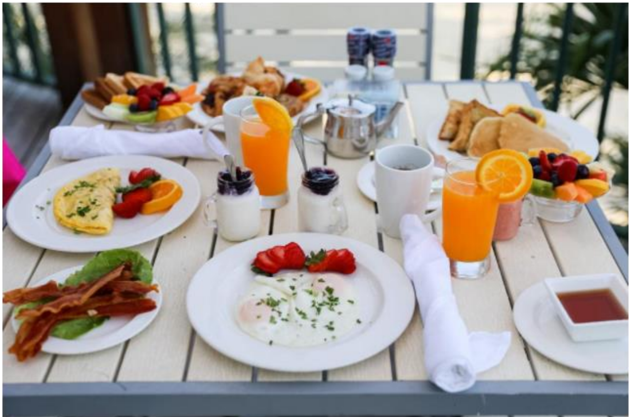
ARUBA - Breakfast at DIVI Aruba All Inclusive J.Q. LOUISE

The trick to traveling right now is ease. We all just want an escape from our current reality and however we can do that with as little fuss the better. Especially for families with young children, taking a vacation may seem impossible right now, but trust me, a few days on a beach will do you a whole lot of good. And when you book the DIVI Aruba All Inclusive, you don't have to think about anything.