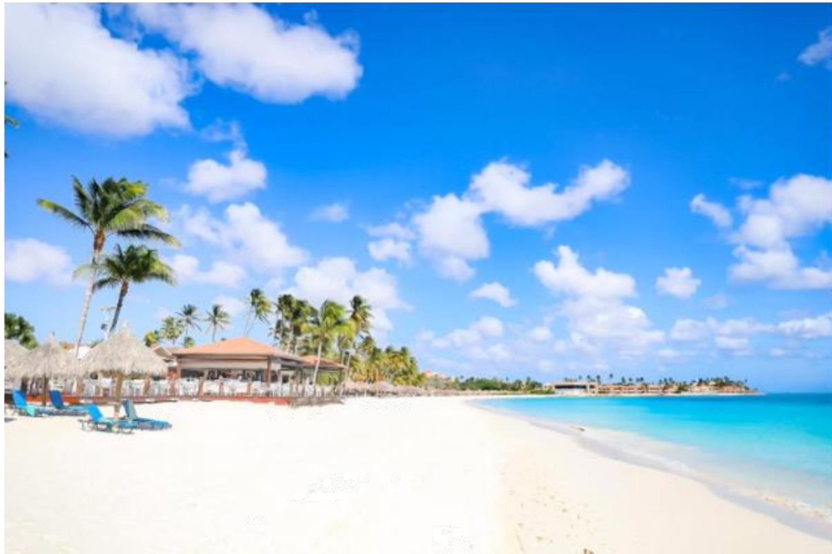
ARUBA - View of the beach at DIVI Aruba All Inclusive J.Q. LOUISE